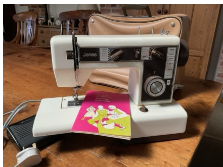
Jones sewing machine in good working order. £20.

Also, ladies quality leather riding boots size 39. £95.