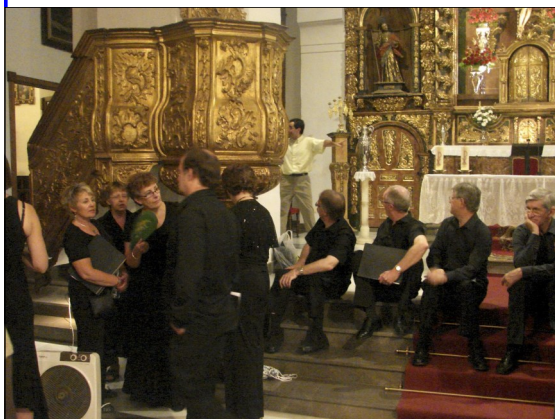
The Lydian Choir preparing for a concert in Spain

The Lydian Choir , a four part (SATB) adult choir, began life in 1975 in Scunthorpe. In recent years, the choir has forged some international links, with two trips to the French Alps and, last year, a trip to Southern Spain. The varied repertoire of the choir is reflected in most of the concert programmes, which often begin with sacred music and end with something amusing. In between, there may be folk songs, spirituals, perhaps a few madrigals. The choir normally sings unaccompanied.