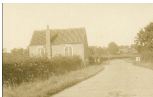
Where is it now? In the Beck