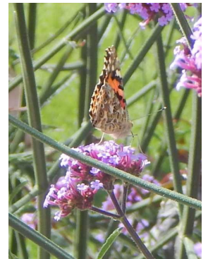
Painted Lady butterfly on a verbena flower.

Verbena Bonariensis is a tall leggy, short-lived perennial plant, native to the grasslands of South America. It is long flowering, drought tolerant, and hardy so long as it growing in a well-drained spot. It looks good in formal borders or more prairie planting styles. Even though it reaches 5 feet (150cm) or more, it is light and airy so it can be grown amongst other plants without blocking shorter things behind it. It attracts both bees and butterflies and will continue to flower until October.