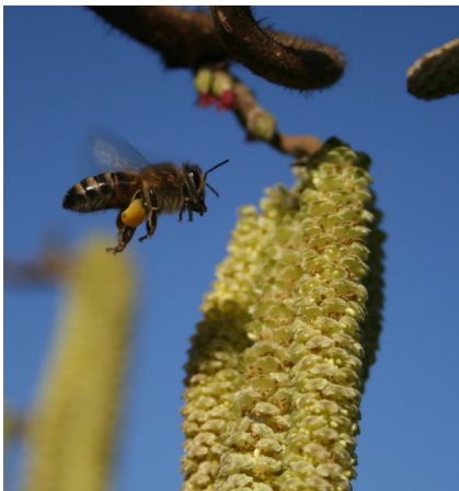
Honeybee collecting pollen from our corkscrew hazel. Note the yellow pollen sack behind her knees.

Hopefully we won't have a March like we had two years ago when the 'Beast from the East' caused me to lose several colonies to the severe cold. Monitoring food stores is still important at this time, as the colonies are getting towards the end of their winter stores. Hopefully the weather will be kind and the bees will start to increase their foraging on plants such as hazel, and alder. Trees are often over-looked as good pollinator plants but they can provide huge amounts of pollen and nectar in a small space.