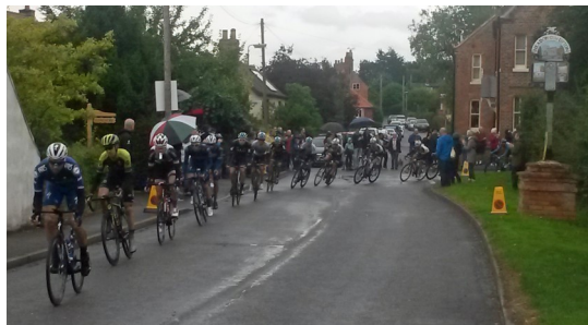
A wet day back in September 2018, as the race passed through Upton

The Tour of Britain cycle race will return to Nottinghamshire for the third time on Thursday 8th September with a 119 mile stage between West Bridgford and Mansfield. As per the previous two times the race has been staged in the county, the route will pass through Upton, this time from the direction of East Drayton before heading off towards Retford via Gamston Woods.